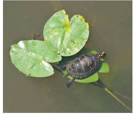
Eastern Painted Turtle