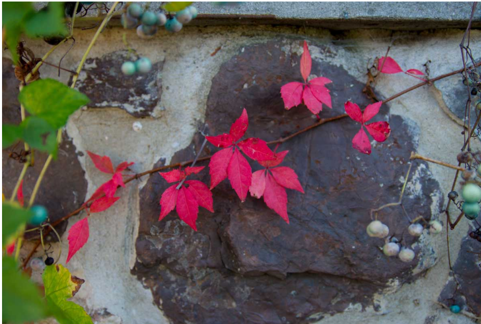
Virginia creeper and porcelain berry